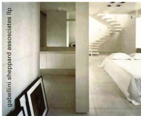
gabellini sheppard associates llp