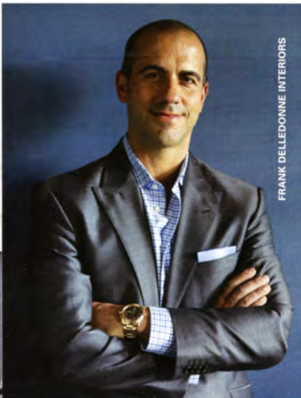
FRANK DELLEDONNE INTERIORS