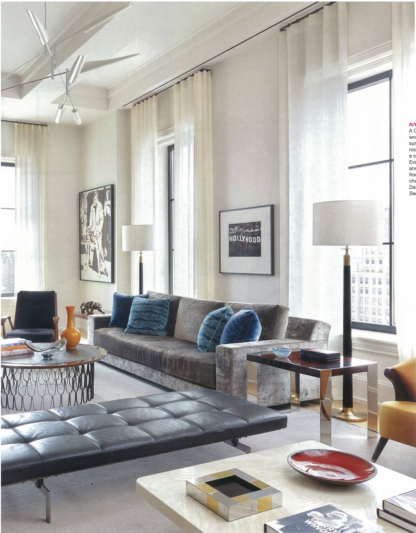
Artful Living A Cindy Sherman work from 2008 surveys the living room, which includes a circa-1960 Paul Evans cocktail table and a Waterloo sofa from Holly Hunt. The chandelier is from David Weeks Studio. See Resources.