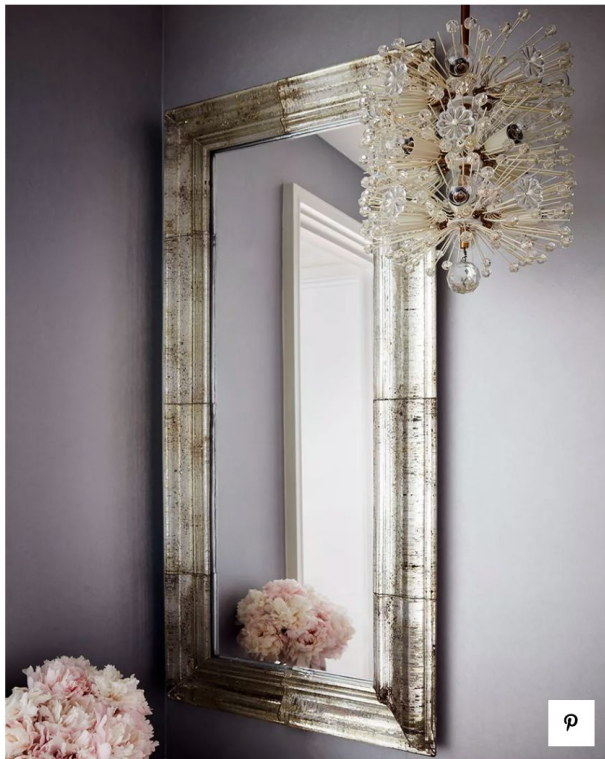
A molded glass mirror is adjacent to a vintage chandelier by Emil Steinar for Nikoll, Austria, ca. 1955.