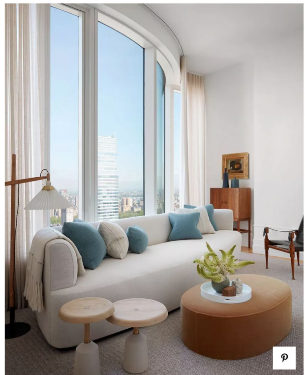
Scandinavian vintage teak cabinet and bedside tables in wood and concrete.