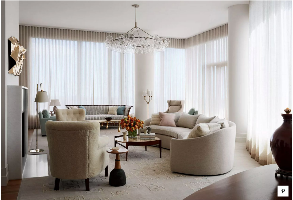
Common living-dining area.