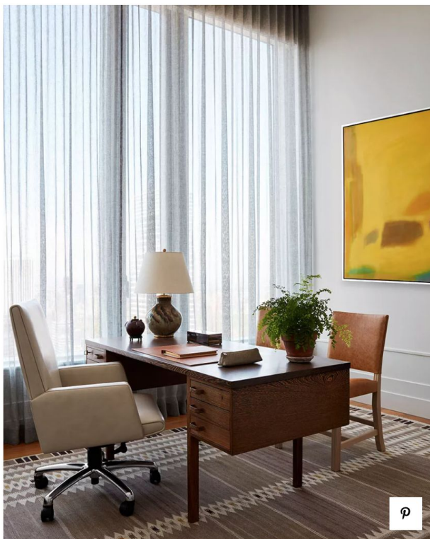
Cabinet. Vintage writing desk, designed by Nunn and Jorgen Dietzel, Denmark. It features a vintage Verre Lumiere Studio lamp. On the wall is the work of Esteban Vicente.