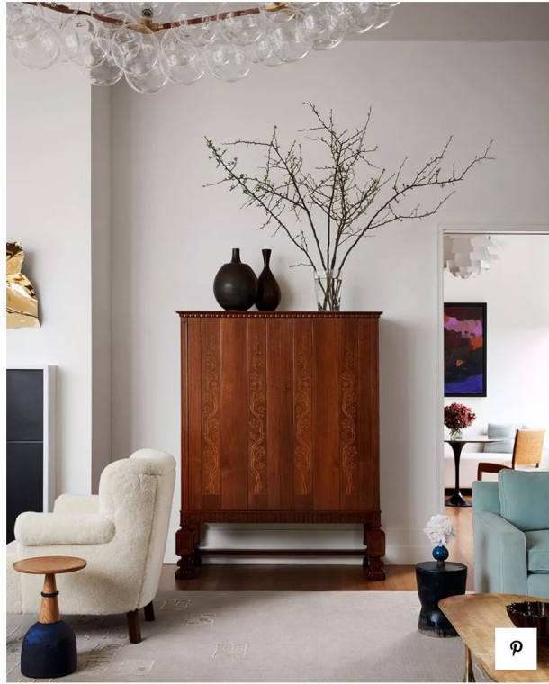
High cabinet by Otto Schulz, Sweden, approx. 1930s from the Bac gallery.

The building stands in Midtown East, Manhattan. This is a residential area within walking distance of Park Avenue shops and Central Park walkways. It was very important that the interior seemed casual, spontaneously created, unlike ordinary apartments in skyscrapers. "