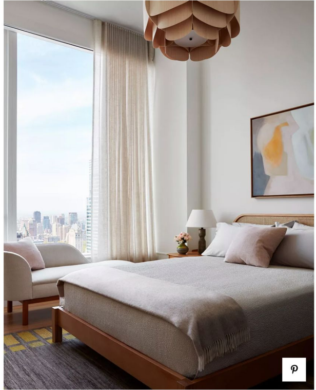
Guest bedroom. On the floor is a vintage Swedish kilim. Painting by Amy Kirshner. Ceiling lamp from Trans-Luxe.