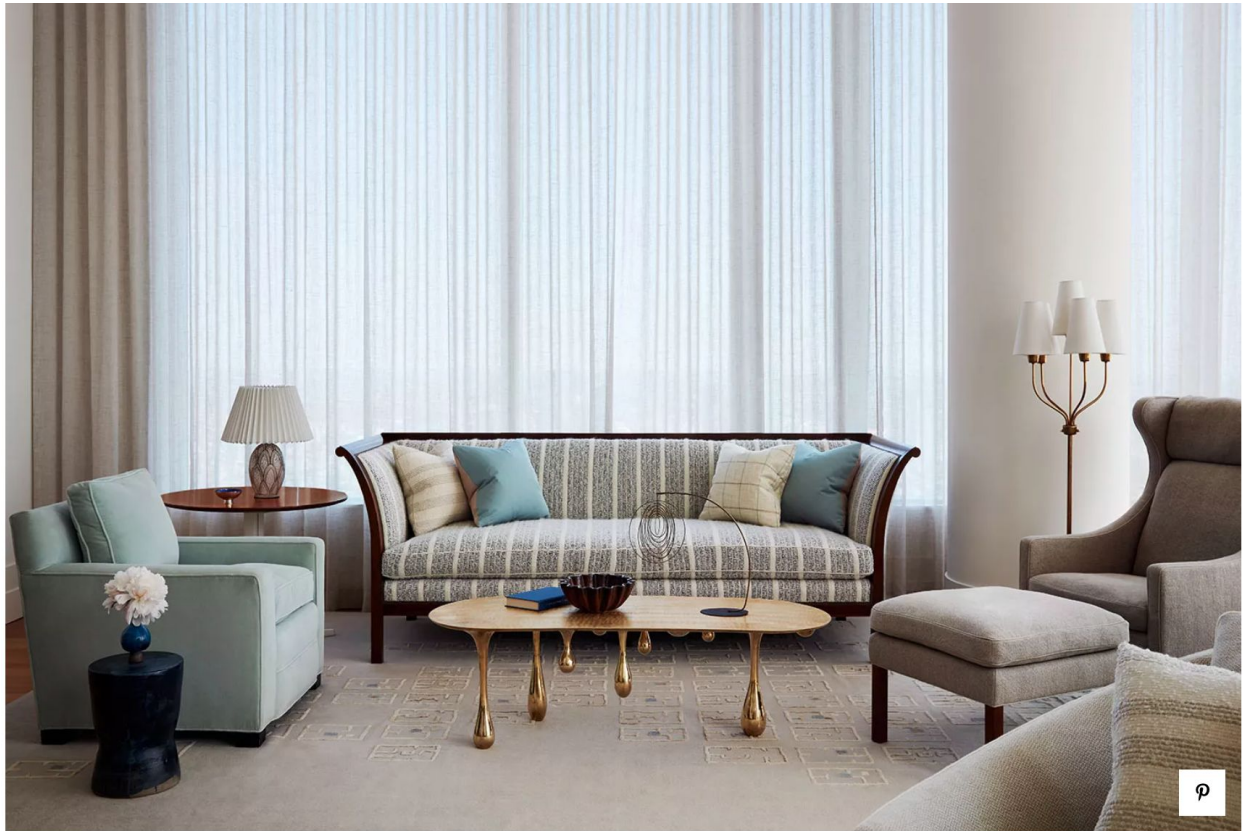
Custom upholstered sofa by Sam Kasten. Contemporary brass coffee table by contemporary Chinese author Zipen Tana. Side table, Josef Frank, Sweden, approx. 1950. It has a table lamp by Jean Besnard, France, 1930s from the Bac gallery.

We were particularly interested in striking a visual balance: we had to think in a holistic way and match items to the artists' work. The key things got the role of stylistic accent, creating the image of the room, while other works, more lyrical and contemplative, were added. "