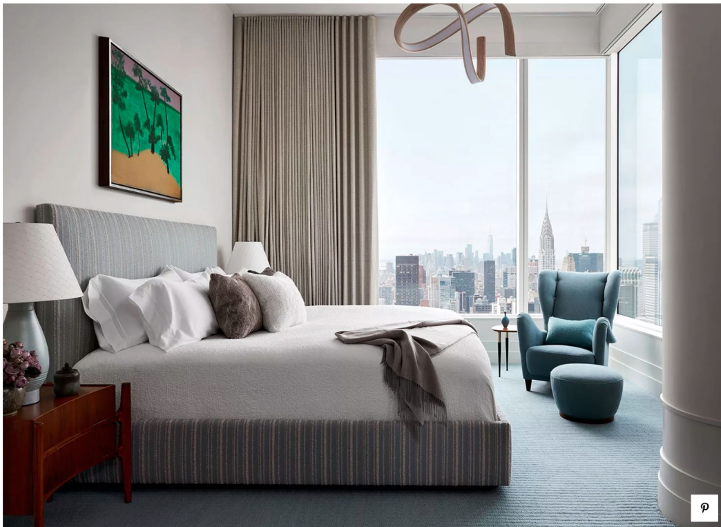
Master bedroom. Armchair, design by Otto Schulz, upholstered by Rogers & Goffigon. William Hinn's bedside table, Sweden, 1950s. Bedside table Lamps by Ewald Dalskog, Sweden, 1930s.