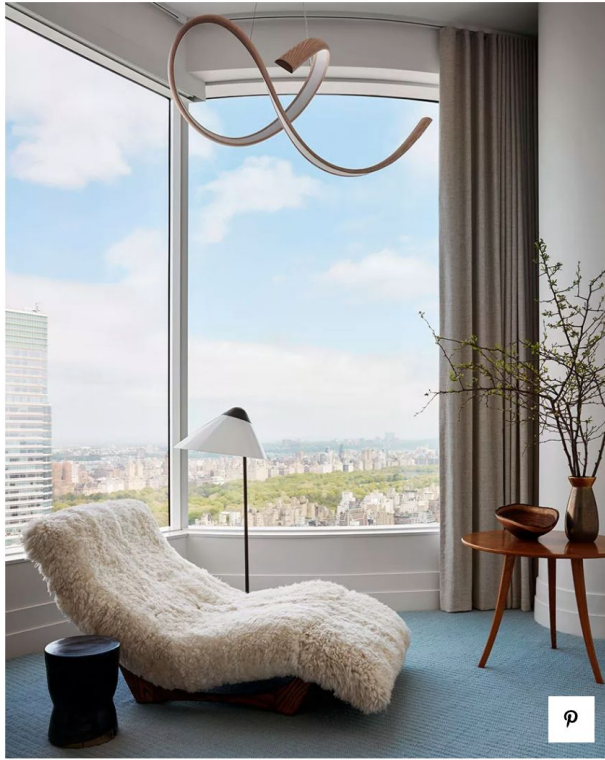
White oak lamp, designed by Joe Prokario, Todd Merrill Studio Gallery.