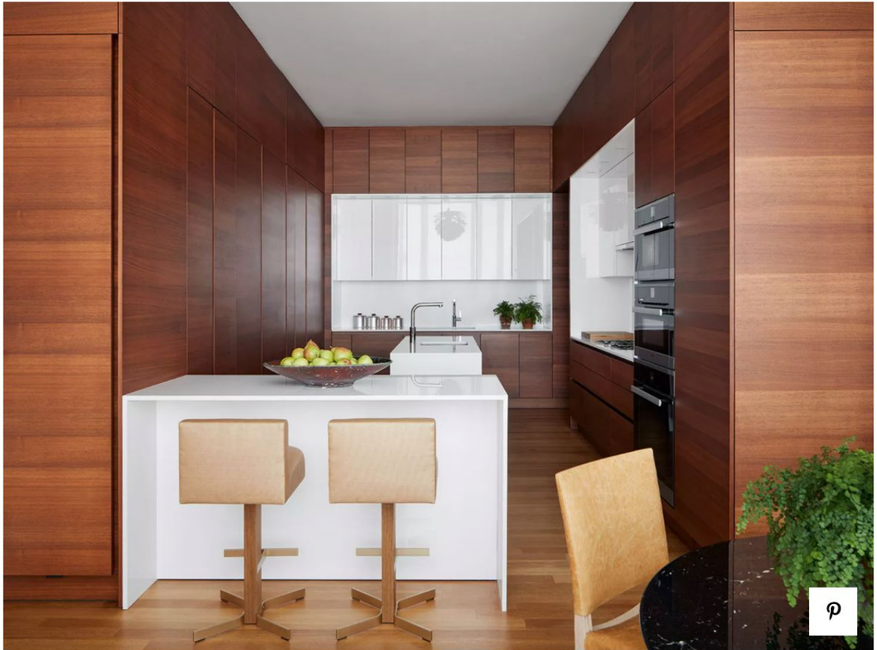
Kitchen. Walnut panels with horizontal texture. White quartz glass worktops and backsplash. Walcott stools from KGBL.