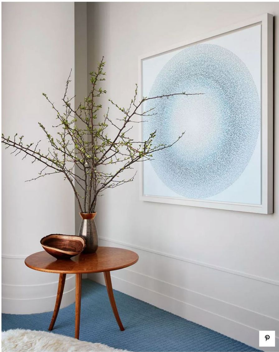
Fragment of the bedroom.