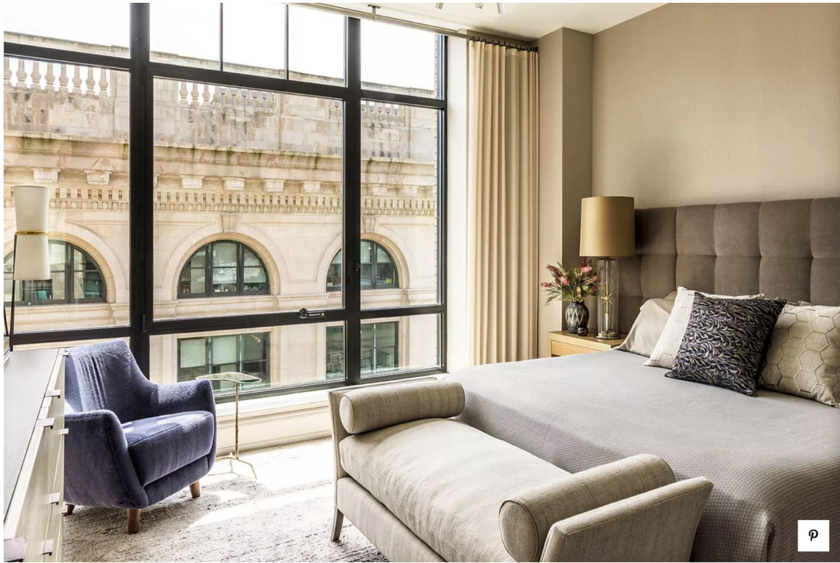
Master bedroom. Armchair Studio Van Den Akker. Upholstery: Holly Hunt alpaca. Floor lamp Clarkson, Aerin.

In the kid's room, the same eclectic feeling can be found– but with a more youthful and feminine touch. The Heracleum chandelier by Moooi branches gracefully around the room and is complemented by more massive lamps, handcrafted from brass, marble, and blown glass.