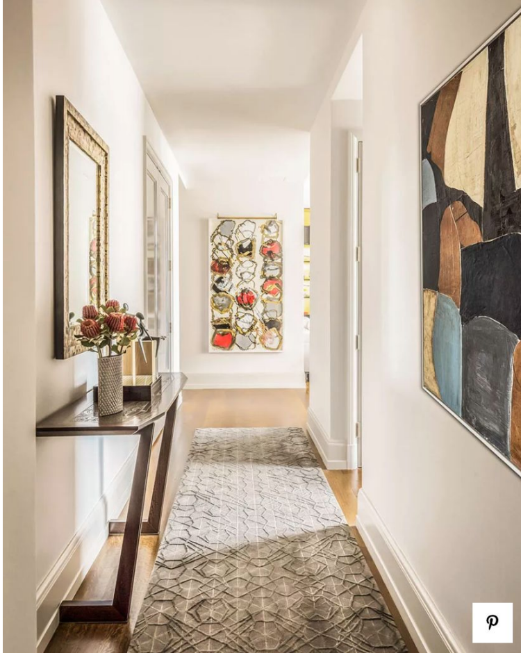
A corridor connects the bedrooms with the living room.