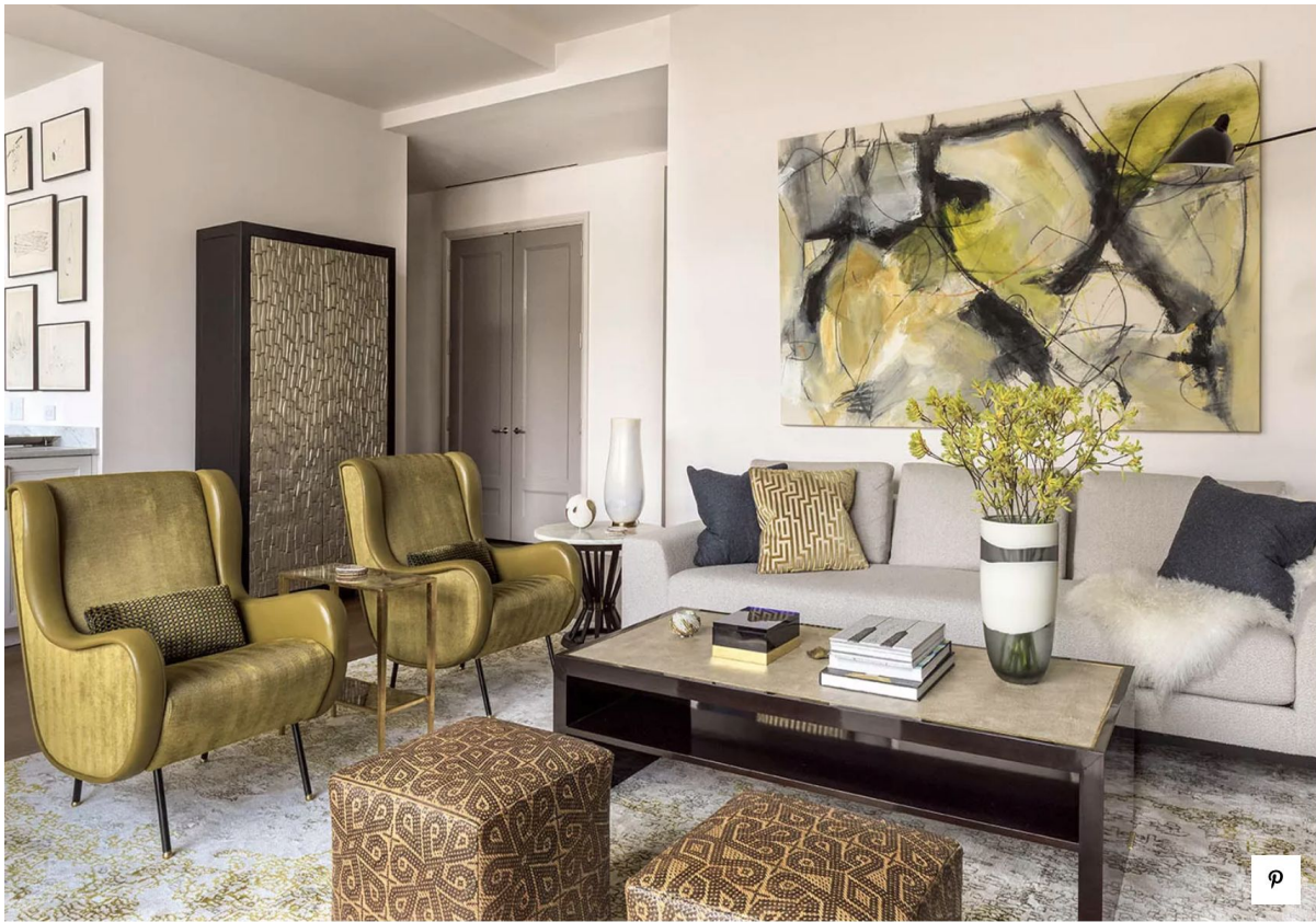
Living room. Caspian sofa, Holly Hunt with Rogers & Goffigon upholstery. Tall Kvat Cabinet, Robert Kuo. Joseph Carini Carpets. Armchairs by Marco Zanuso, 1951. Gilded iron two-tier side table purchased at 1stDibs. Ottomans Borneo, Walker Zabriskie Furniture