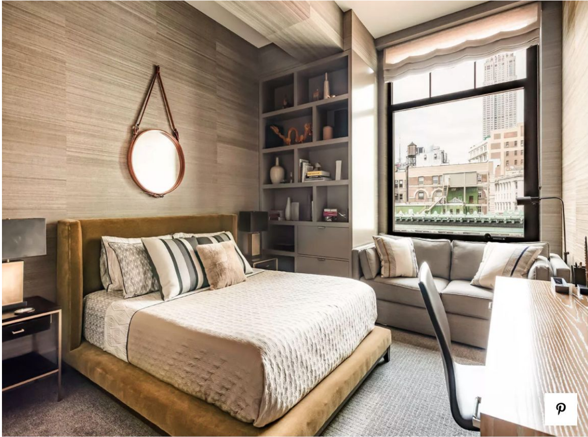
A guest room.