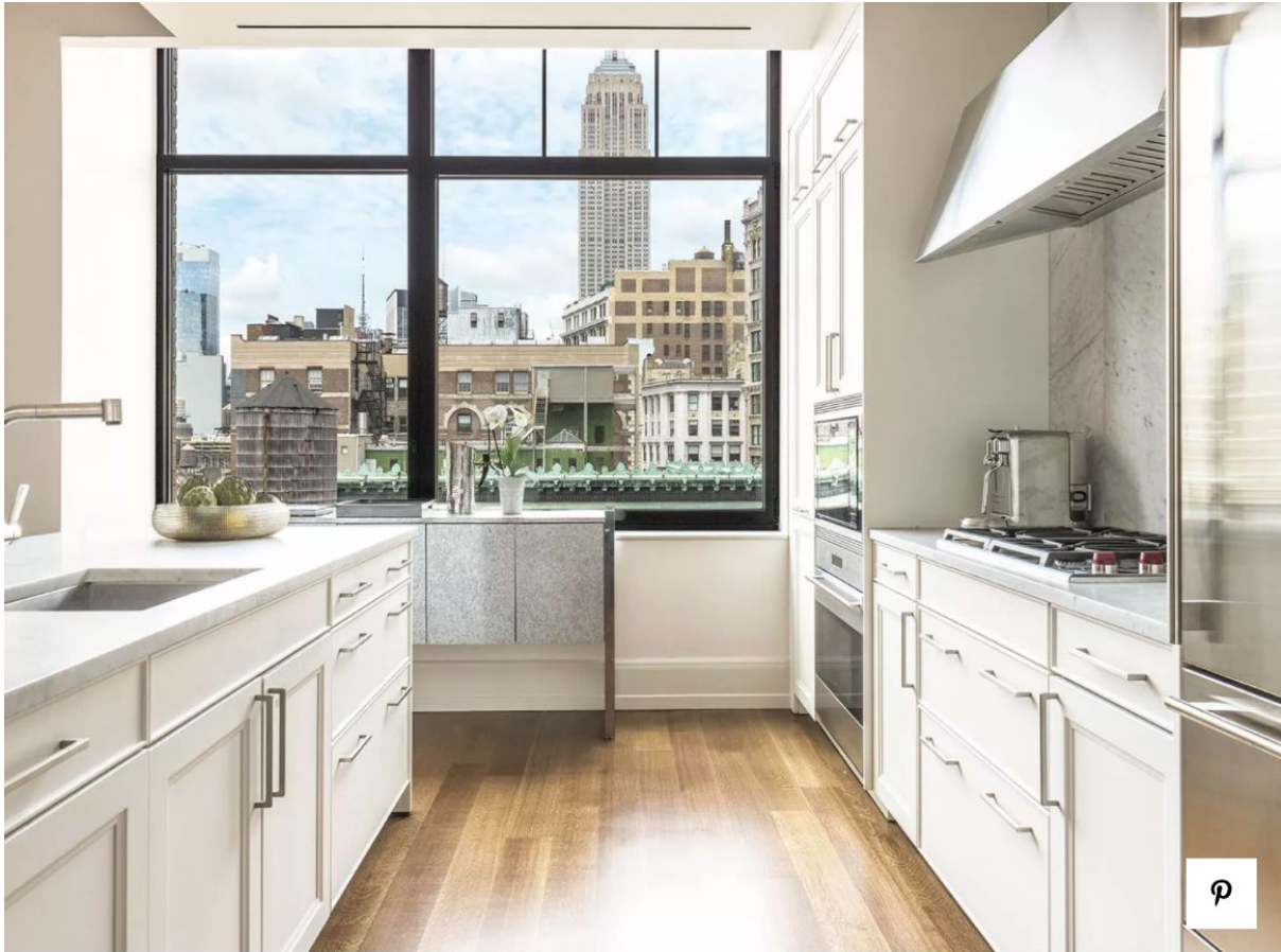
The kitchen area is built next to the dining room.

The "special moment" in this home is the light. The lighting throughout the apartment is an eclectic collection of fixtures, both new and vintage, that reflect the style of our clients as well as the Flatiron area of Manhattan. It was important to capture and combine classic design with modern, and linearity with organics to achieve that special New York energy that goes hand in hand with typical skyline views.