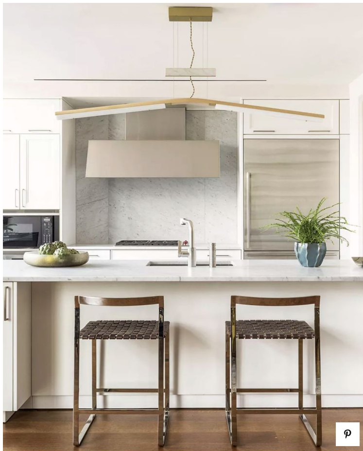
The kitchen is finished in white marble.