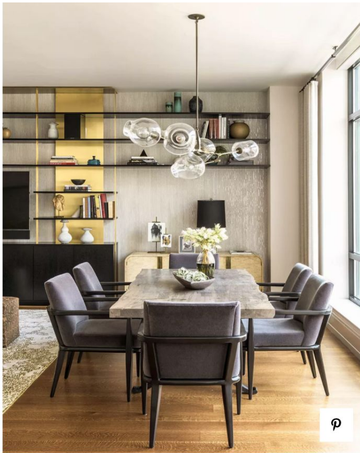
Dining area. Rack New Day Woodwork. Distinctive Windows curtains. Lindsay Eidelman chandelier and table, BDDW. Chairs by the A Rudin table, upholstered by Holly Hunt. Accessories from BK Antiques, Balsamo and Flair