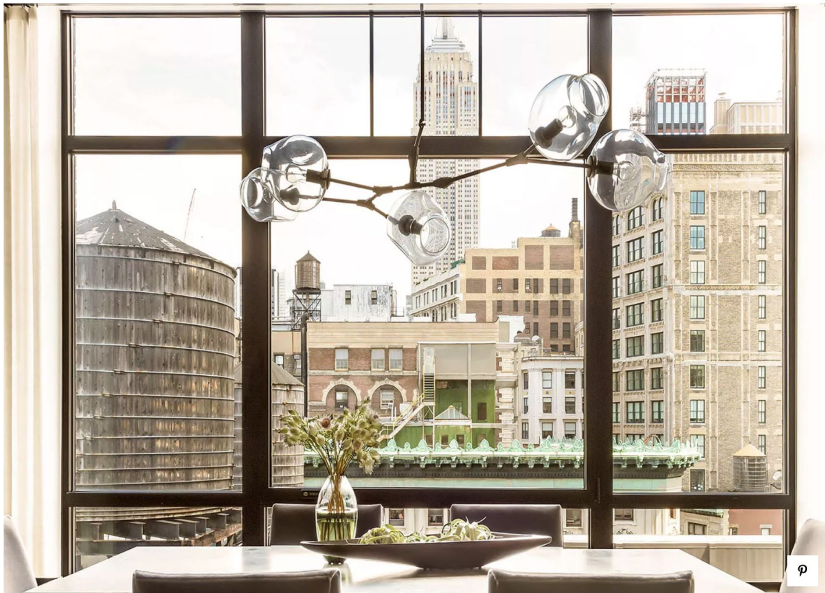
The view from the window is emphasized by the interior setting.