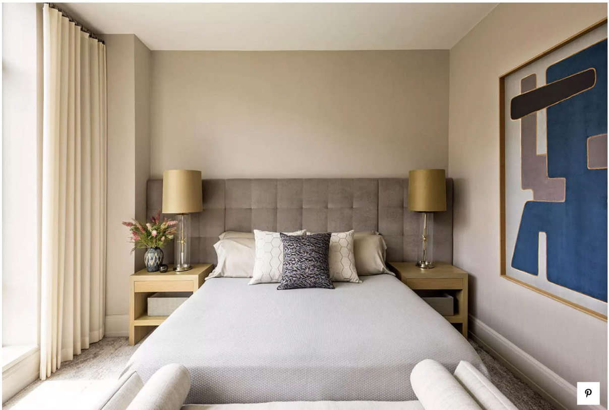
Master bedroom. Custom king size bed, NY Upholstery, Teskyl Kravet. Pedestals from Ruby Beets. Table lamp Starburst, Barneys and Fortuny.

In the kid's room, the same eclectic feeling can be found– but with a more youthful and feminine touch. The Heracleum chandelier by Moooi branches gracefully around the room and is complemented by more massive lamps, handcrafted from brass, marble, and blown glass.