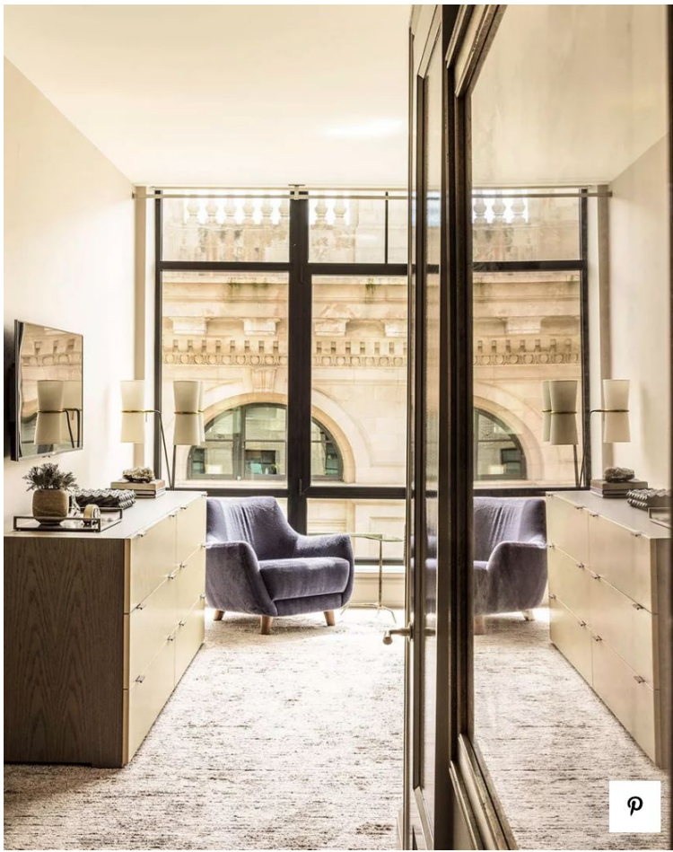
Fragment of the master bedroom.