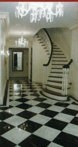
An Upper East Side residence with architecture by Ageloff & Associates