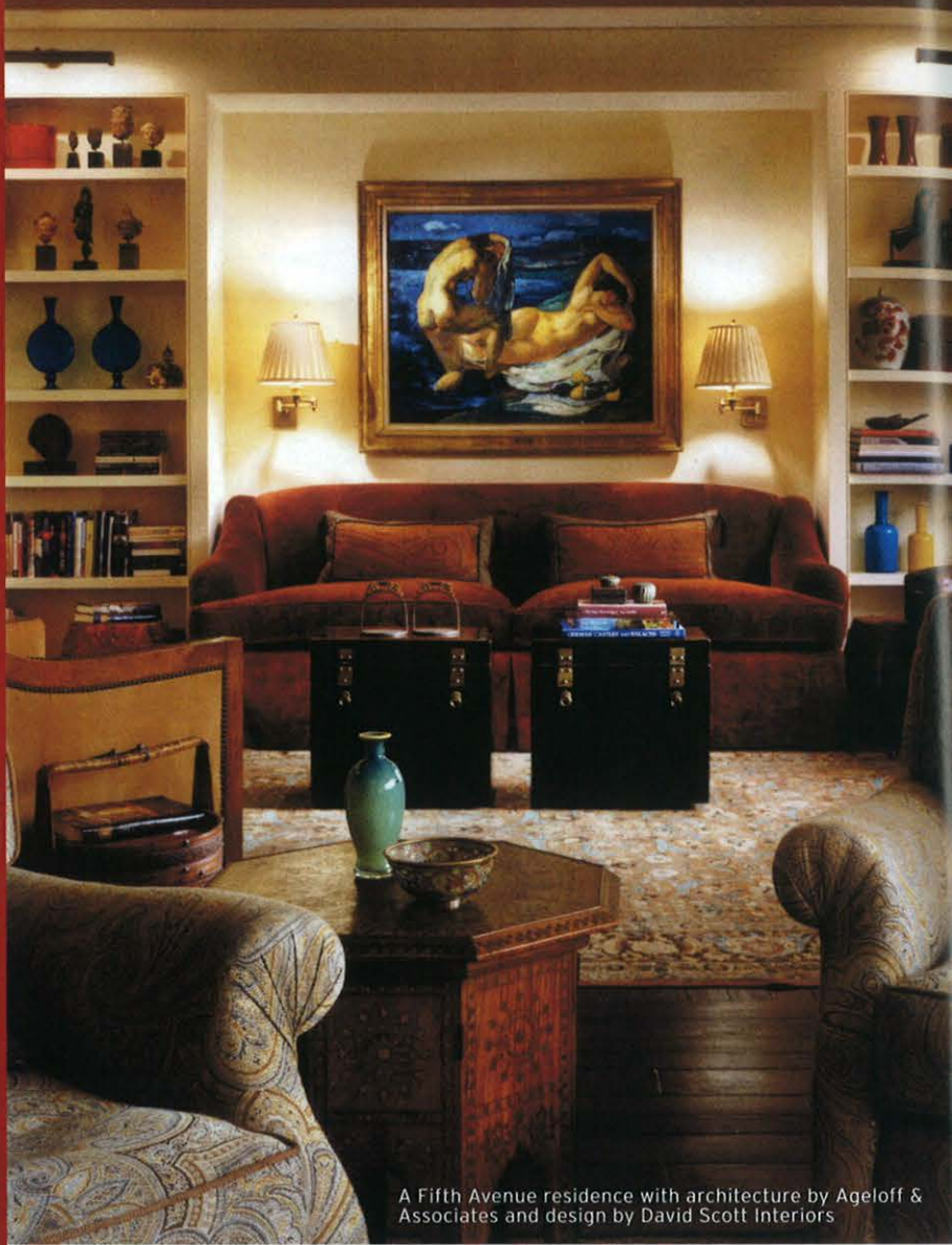
A Fifth Avenue residence with architecture by Ageloff & Associates and design by David Scott Interiors