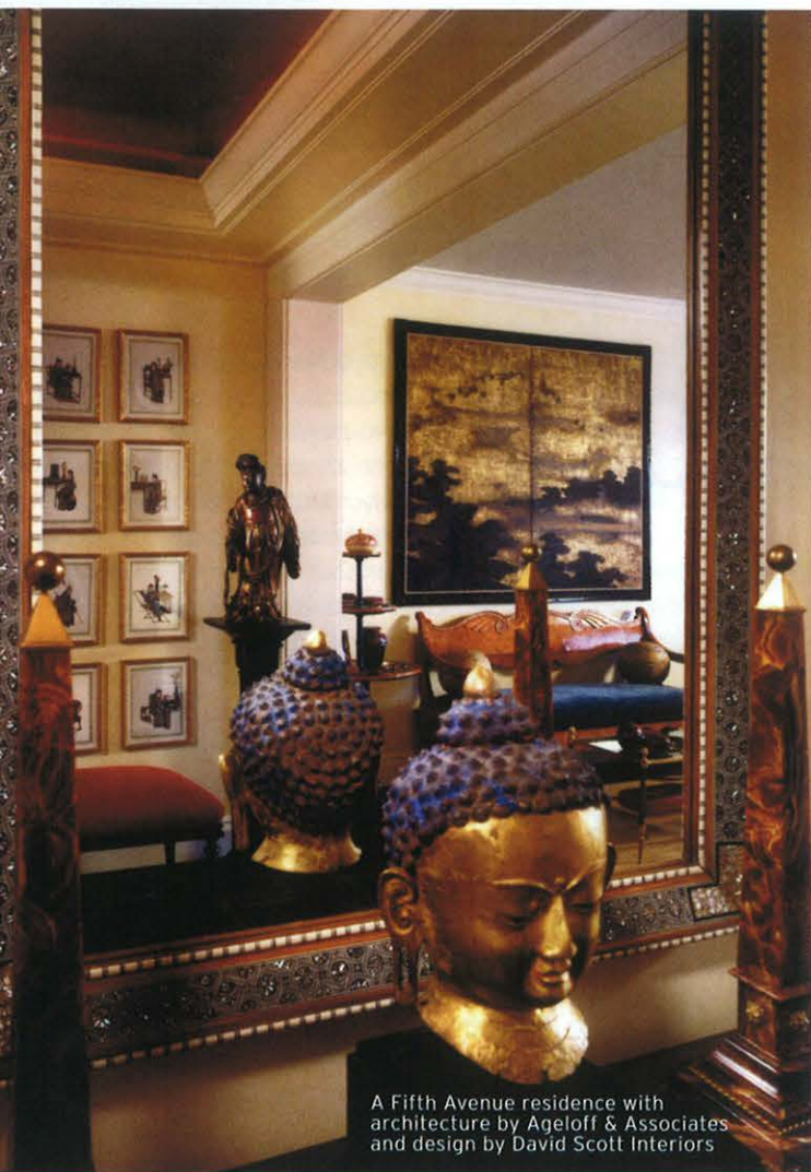
A Fifth Avenue residence with architecture by Ageloff & Associates and design by David Scott Interiors