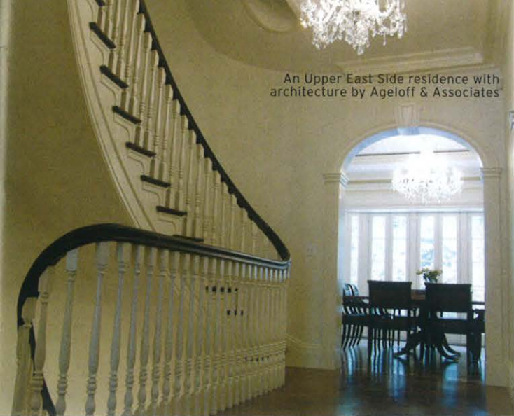
An Upper East Side residence with architecture by Ageloff & Associates